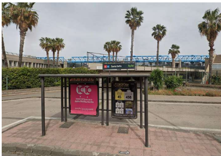
BRT BUS STOP - Via SANTA SOFIA n.100